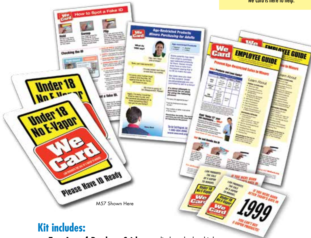
M57 Shown Here

Equip your store with the tools you need, today. As a national non-profit organization focused on ensuring that age-restricted product retailers are fully educated, trained and prepared to reject underage sales, We Card is here to help.