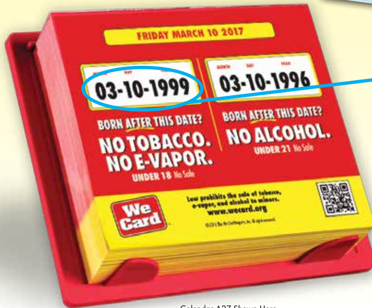
Calendar A27 Shown Here

HOW IT WORKS: Place your calendar on the counter and simply compare the date displayed on the calendar with the date of birth on the customer ID. Is the date on the ID AFTER the date on the calendar? Refuse the sale!